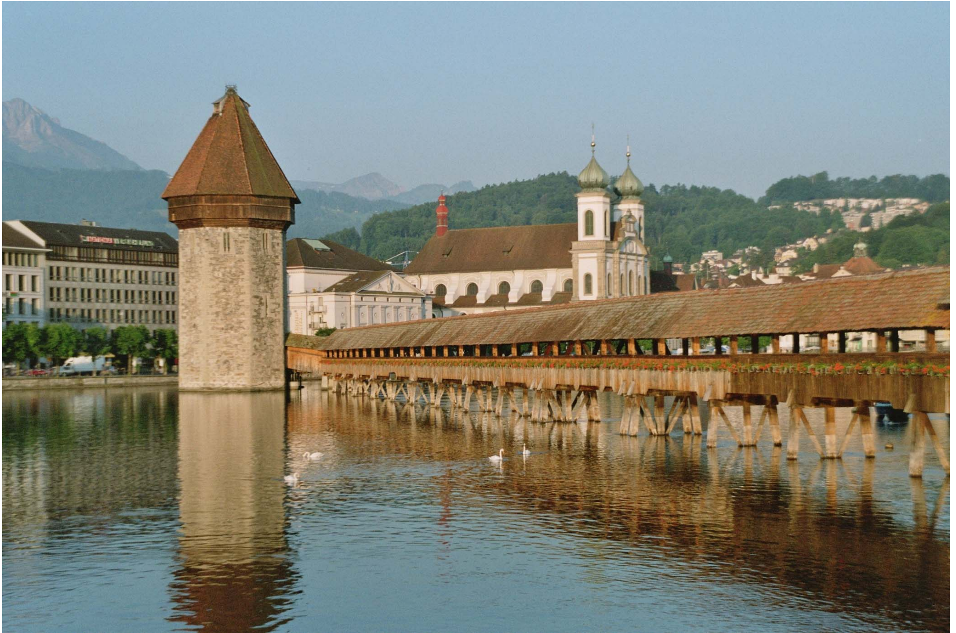
Charming medieval town and setting