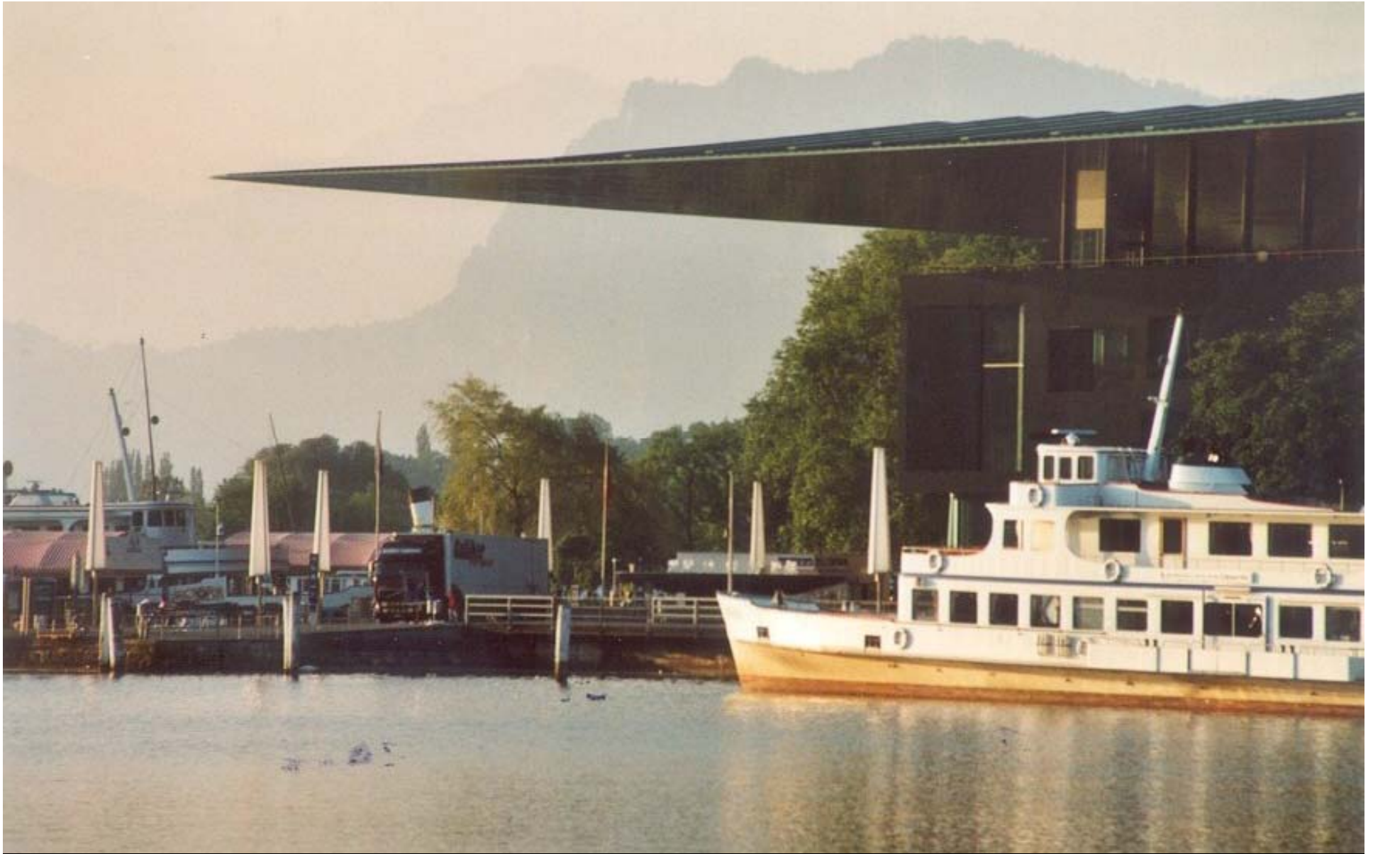
Lake, mountains and good services