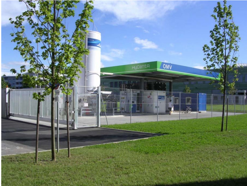
HyCentA (Hydrogen Center Austria)